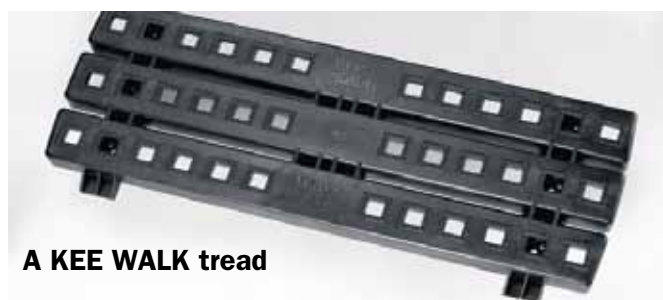
A KEE WALK tread

Manufactured in high grade nylon incorporating raised roughened sections, the treads are developed to comply with EN 516 (Prefabricated Accessories for Roofing – Installations for roof access – Walkways, treads and steps), exceeding the deflection criteria and slip resistance requirements of the standard.