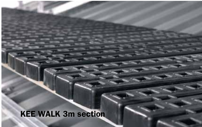
KEE WALK 3m section

KEE WALK provides a flexible, easy to assemble walkway system designed for use on most modern roof types. To demonstrate the flexibility of the system, a brief explanation of the key constituent parts; the longitudinal configuration, the configuration to traverse a roof, the step configuration and the treads is given below. The anti-slip characteristics of the walkway are essential for user safety. The British Standard (BS 4592) requires a minimum co-efficient of 0.4 as a measure of the friction and KEE WALK achieves almost double this in both wet and dry conditions. Specific fixing packs are supplied for the different roof types.