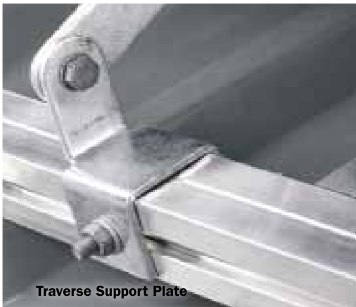
Traverse Support Plate

KEE WALK is designed to make the task of building a walkway across a sloping roof a straight forward installation, again using a standard set of components. A traverse section of walkway uses a standard KEE WALK section for the level walking surface which is mounted onto a sub-frame fixed to the roof. The two sections are joined with hinged brackets at the rear of the assembly and use the rotating arms at the front to level the walking surface, as depicted on the adjacent photograph.