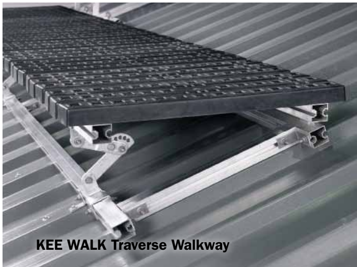
KEE WALK Traverse Walkway

Supplied pre-assembled by Kee Safety to facilitate rapid on-site installation and thus minimise installation costs, these standard lengths have 12 treads per 3m. Weighing only 24kg, the standard lengths are easily positioned and aligned. They are joined together by a simple 100mm long straight connector which attaches to the bearer bars.